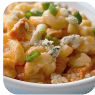
Buffalo Mac & Cheese