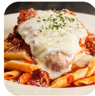
Chicken Parm w/ Penne