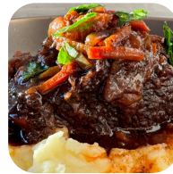
Braised Beef Short Ribs