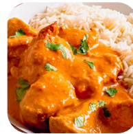
Cauliflower Tikka Masala